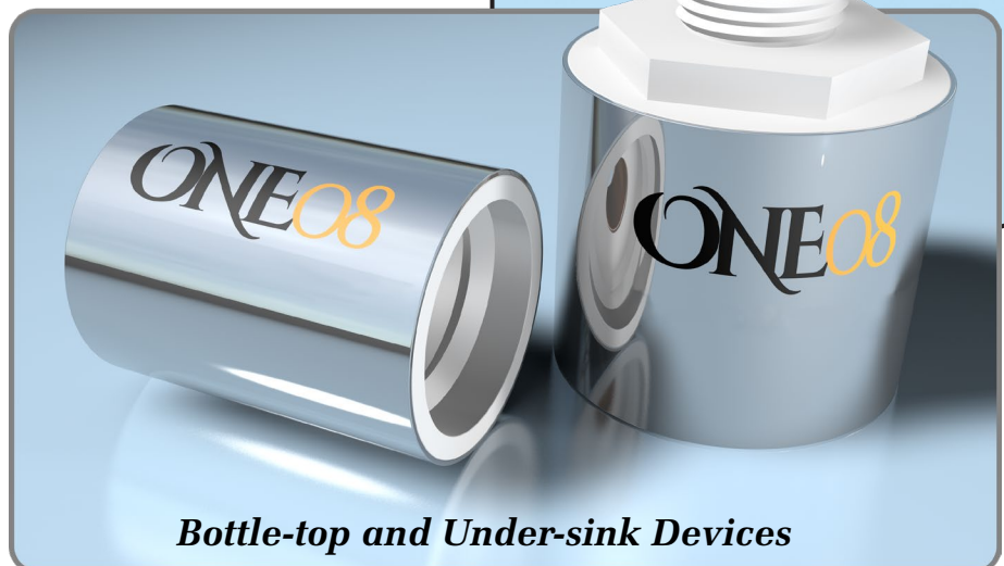
Bottle-top and Under-sink Devices